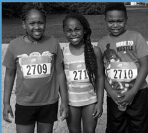
Children from Lincoln-Douglas School take part in the Kids Run 5k.